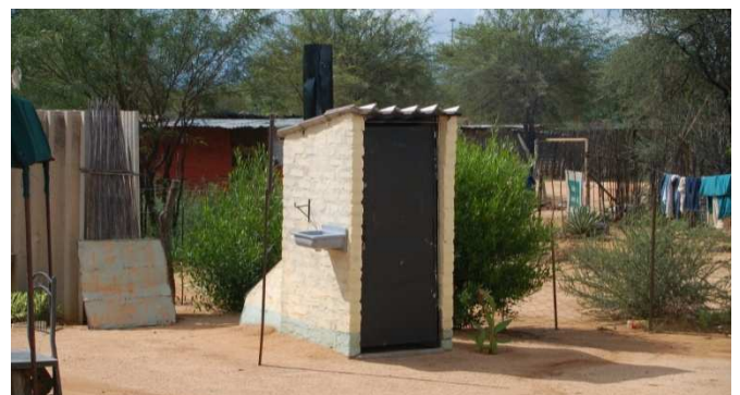
Fig. 3: Otji-toilet with attached hand washing basin

Against this background, the Omaruru Basin Management Committee decided to pilot 21 Otji-toilets in Omaruru (Fig.3). People living in the project area have no access to safe sanitation. Especially, for women and children, the traditional way of “going to the bush” is dangerous. During the rainy seasons, water related health problems such as diarrhoea are increasing. The project was planned as a pilot study to show that dehydration toilets with urine infiltration are an appropriate sanitation solution for the informal settlements of Omaruru, Namibia.