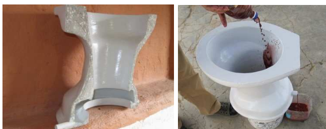
Fig. 4: Cross section of urine diversion bowl (left) where urine collects in the little trough at the bottom as demonstrated in urine diversion bowl (right) (source: CHP, 2009)

The toilet bowl is designed in such a way, that fluids touching the wall of the bowl are collected in a small chute and can be drained away through a pipe and separately infiltrates it into the ground (Fig. 4). No problems of blockages of the collection chute or the urine pipe, which is 20mm in diameter, have been reported.